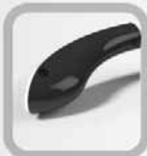
button for air-purifying selection mode