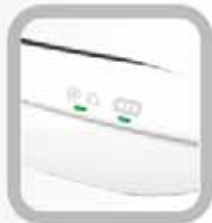
Display with LED : operating status and the battery status