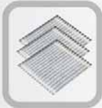
Triple multi filter : Midium-carbon-HEPA (Grade:h12)